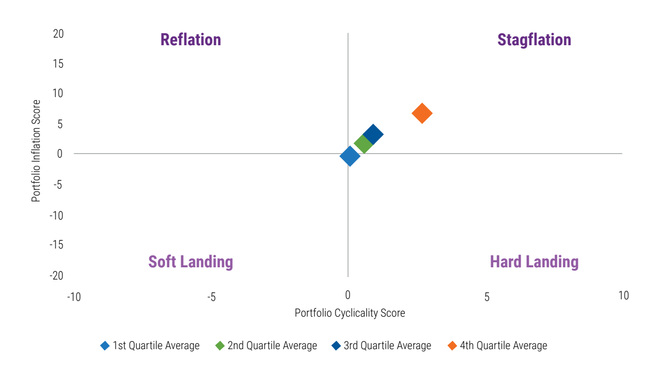
FIGURE 5 - Soft Landing Positioning Paid Off

The Portfolio Analysis & Consulting Moderate Risk Peer Group is based on 236 moderate portfolios submitted to Portfolio Analysis & Consulting from July to December 2023. Data as of 12/31/23.